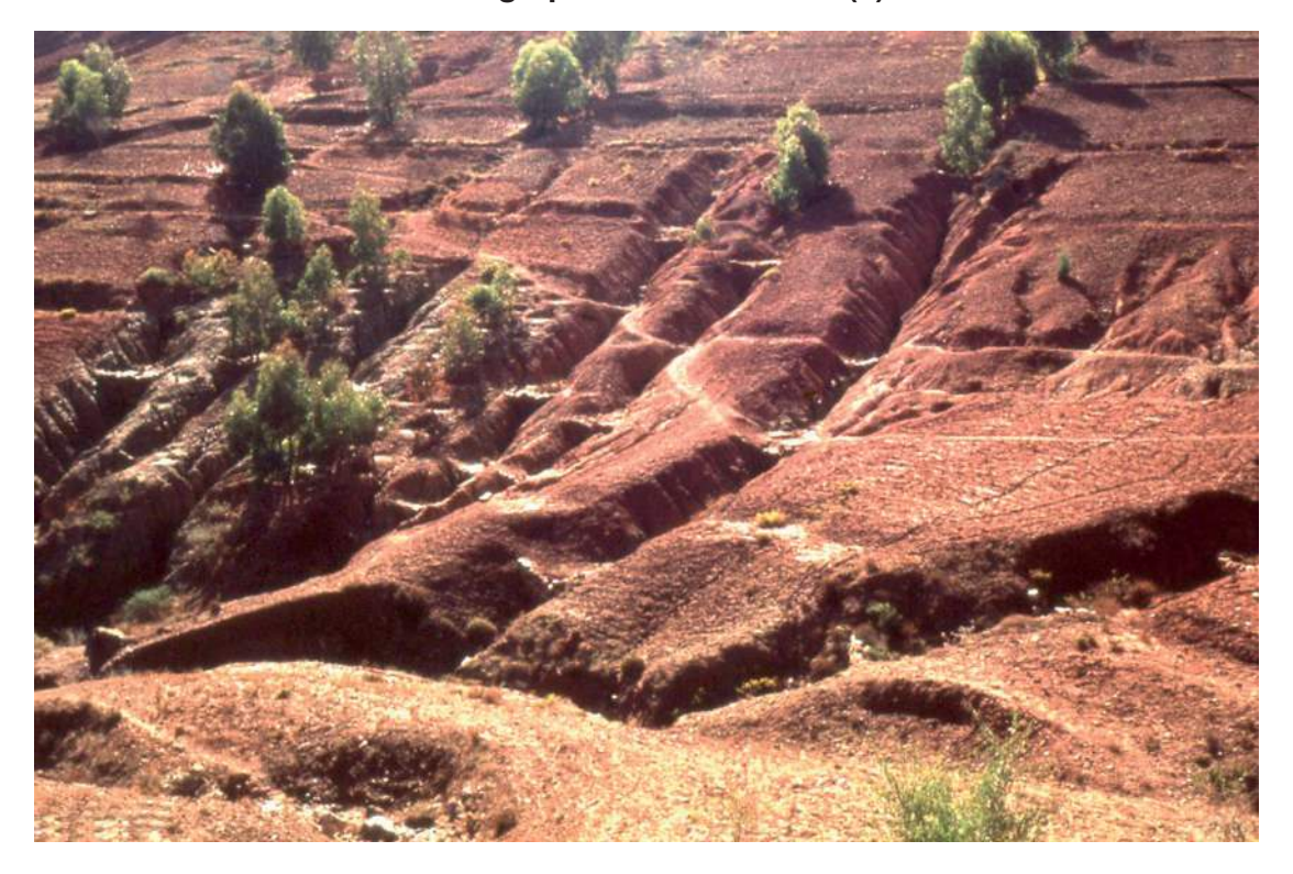
Photograph B for Question 2(c)